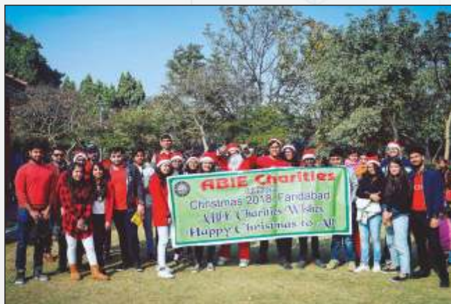
Christmas Celebration-25th Dec @ Faridabad, Haryana, India.