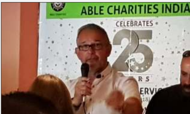
Some of the guests in London Charity Dinner- July 2018

One Kind Act London donated 6000 pounds for free Eye Cataract Operation for poor needy people at Palwal.