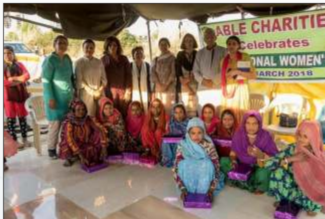
Women Day 2018

All the festival, national days celebrated at ABLE with great enthuzasiom , below is the one glimpse of few