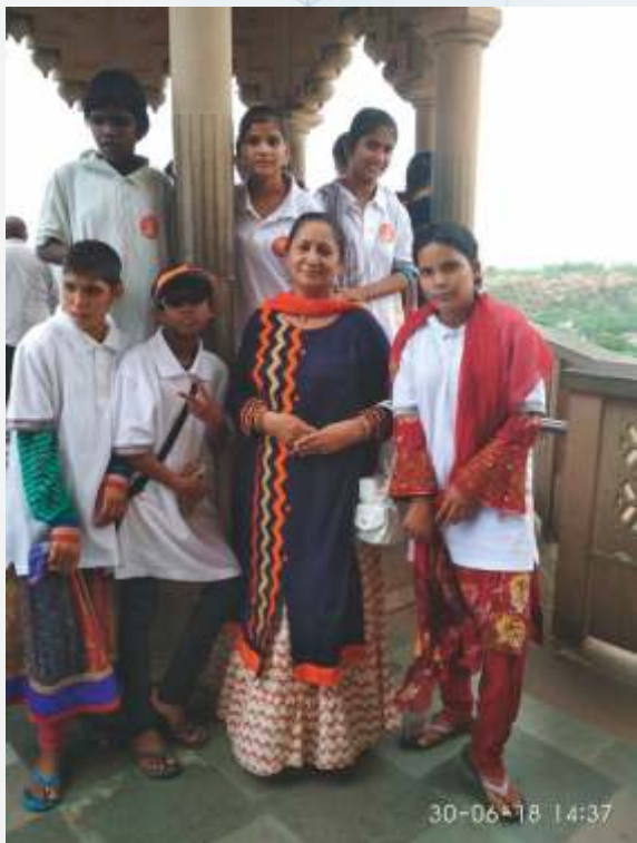
PREM GHAR Girls gone to Vrindavan Temples.