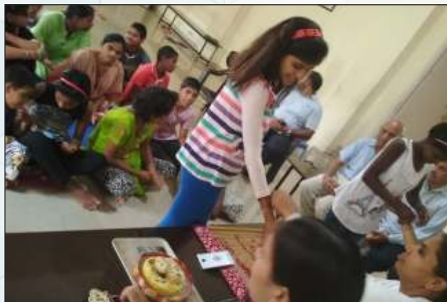
Raksha Bandhan Celebration @ PREM Ghar Palwal