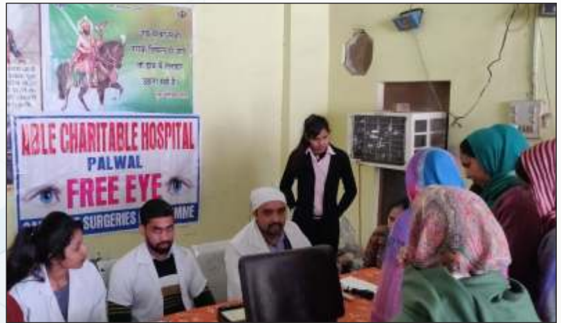
Free Eye check up camp organised by ABLE Charitable Hospital

Preventing Health Campus - To make the general public aware on different health issues we organize 300 medical campuses, covering the approximately 80 villages of Faridabad, Palwal, Nuh and Mewat district.