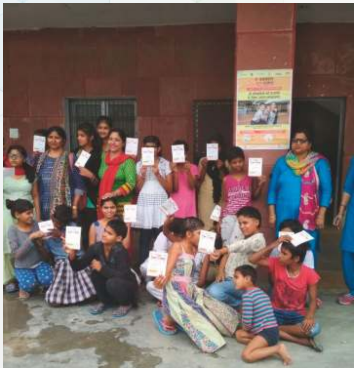
Vaccination Drive @ ABLE PREM GHAR for GIRLS