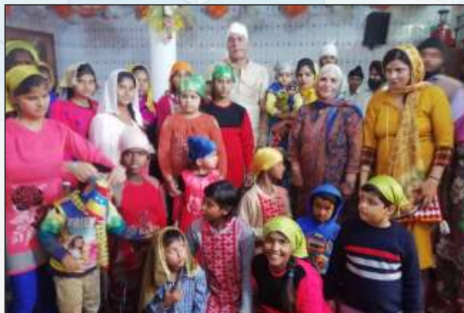
PREM Ghar Girls @ Gurudwara on GuruPurab