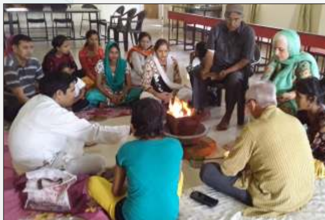
Havan @ ABLE PREM Ghar - New Year