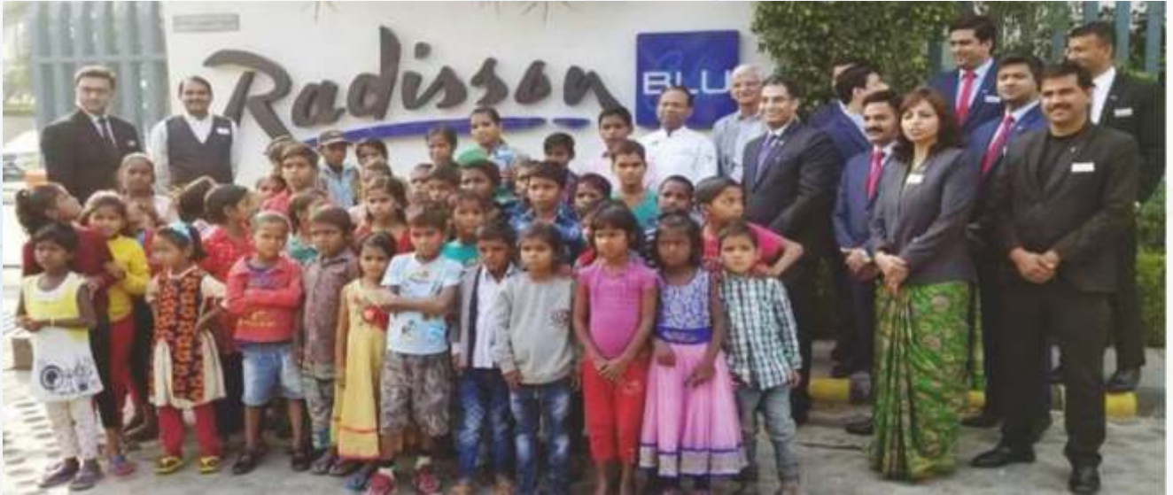
ABLE's Annual Event organised on 23rd Sept. 2018 @ Radisson Blu Faridabad, Haryana