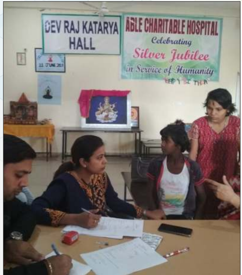
Health Check up @ Prem Ghar