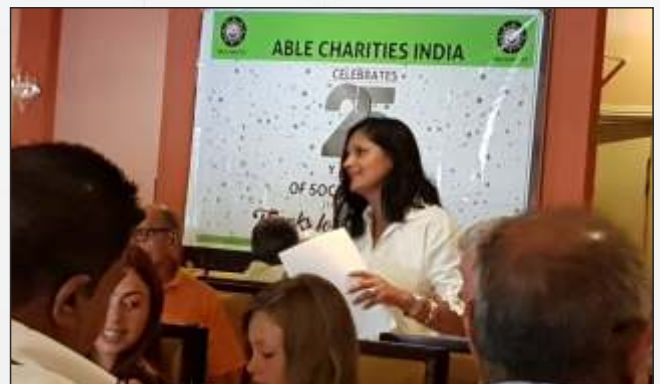
ABLE CHARITIES Organised at Nottingham England