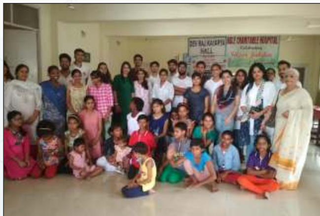
Independence Day Celebration @ PREM GHAR