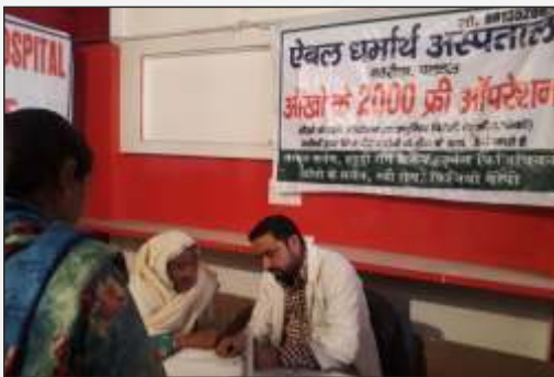
Eye Camp organised by ABLE Charitable Hospital